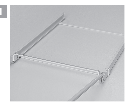
Separate the top frame from the bottom frame.