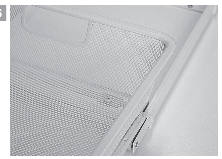
To install, slide drawer with attached elfa<sup>®</sup> Easy Glider<sup>™</sup> onto the bottom frame.

Mount 4 clips on the top frame, with the holes towards the inside. Make sure that the clips are approx. 1''/25 mm from each side. (See arrow above.)